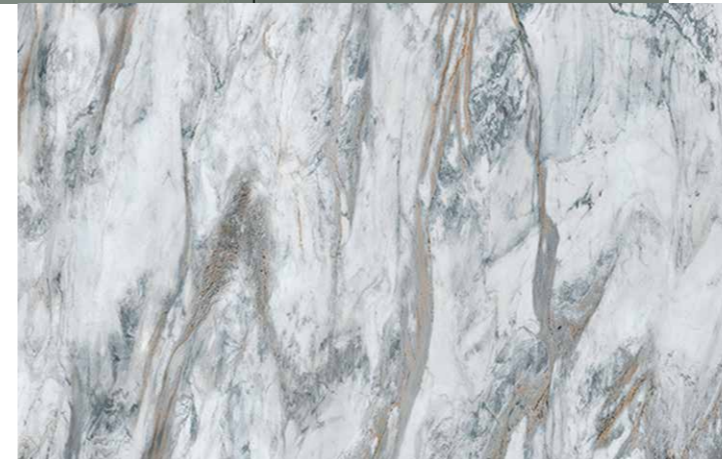
Oliana™ Finish: Gloss

The slim SupaWood® substrate offers a smoother surface for finishing whilst the higher density improves performance characteristics and durability. This slimmer profile pairs perfectly with handleless cabinetry and open-plan living.