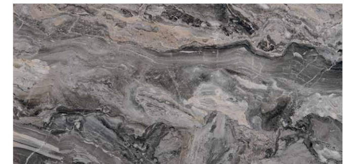
Cassiopeia™ Finish: Gloss

Our Formica® LifeSeal® Worktops are made with a moisture-resistant decorative surface bonded to a durable, slim SupaWood® core. Proper sealing on all the edges of the worktop (including those up against the wall, butt joints and any cut-outs for sinks and stove-tops) will protect the core from moisture, so your top will not swell and should last for years to come.