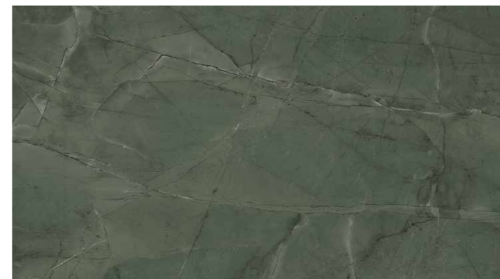
Pantana™ Finish: Gloss